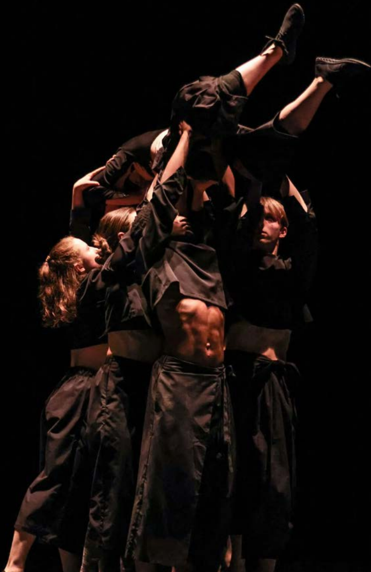
Threads, Loïc Faquet © Sud Reportage