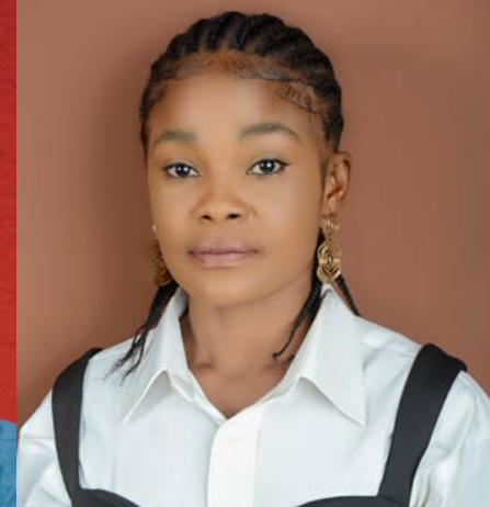
1 - © João Catarino | 2 - © Declan Murphy | 3 - © Alexander Polna | 4 - © tendance photographie