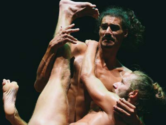
Dead Mouse, Milena Ugren Koulas