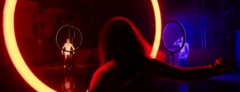
INSERT COIN PLAYER ONE, Kosta Karakashyan