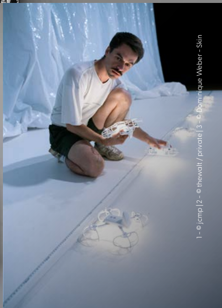
1 - © jcmp | 2 - © thewalt / private | 3 - © Dominique Weber - Skin