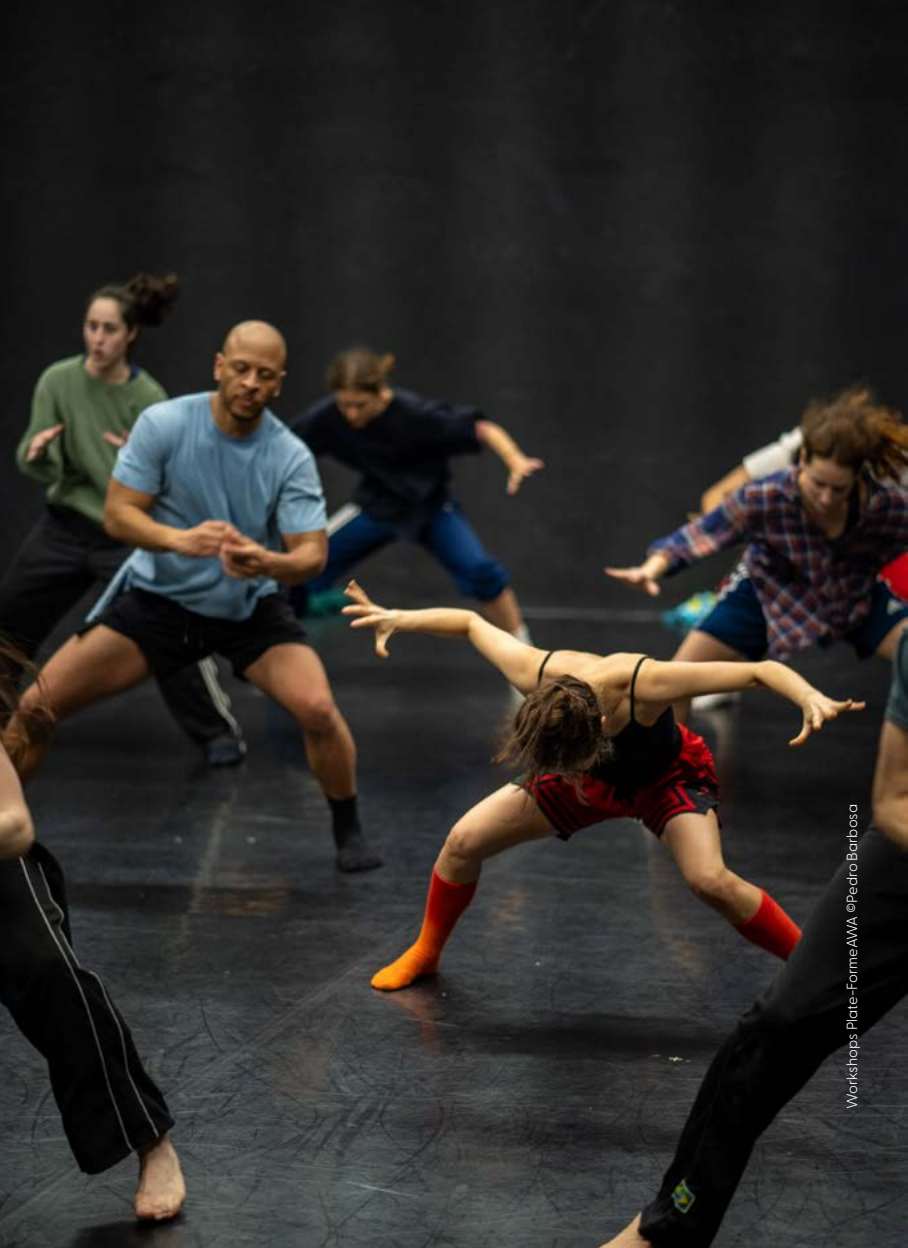
Workshops Plate-FarmeAWA