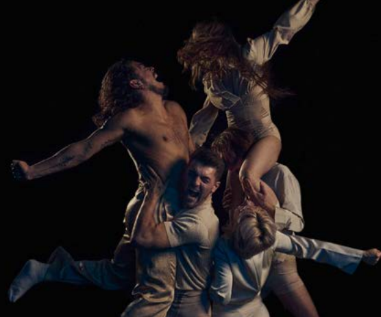
Sans quoi nous crèverons, Virginie Brunelle

Sometimes calm, sometimes very energetic, this session invites children to discover themselves through dance — a playful moment to develop rhythm, coordination... and the pleasure of dancing together!