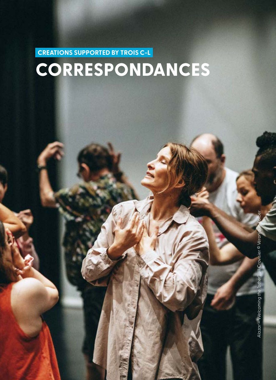
Alazar – Welcoming the “other” - Jill Crovisier

The Mierscher Theater presents Correspondances : four new choreographic creations made for and with the Ensemble blanContact. Three of them are supported by the TROIS C-L: