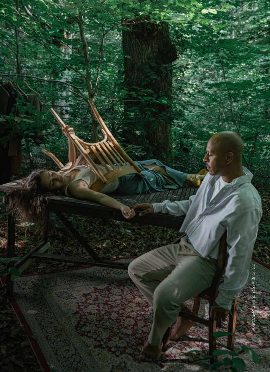
AKROAMA de Brian Ca © Brian Ca